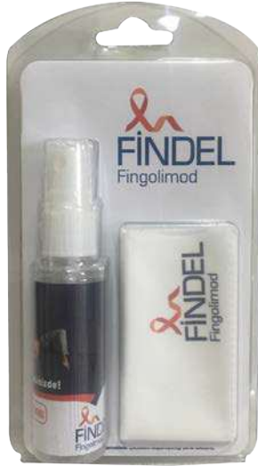
Front side visual